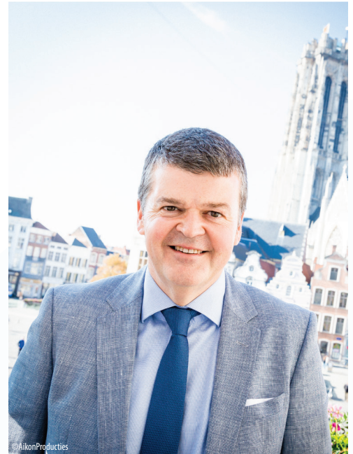
Bart Somers , Mayor of Mechelen

We also think that this publication will be of interest to liberal politicians and activists working at any level of government, as a useful source of reference for the liberal principles that guide their political action. Let's build a liberal Europe and a liberal world together!